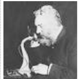
Alexander Graham Bell

This production brings to life a number of remarkable scientists in just 45-minutes!