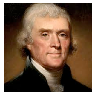
Thomas Jefferson: Lover of Science!

What's something that frustrates your students in their every day life? Walking a pet? Cleaning their room? Doing their homework? What's an invention that they could create to help make their life better? Most inventions come about to help the world be a better place. Have them think about something that would help them. Perhaps sketching it out on paper down to the very materials they would need. The Wright Brothers spent $1000 to build the first plane, how much would they need to create their invention?