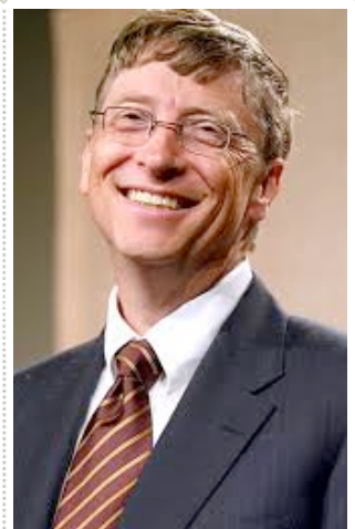
Bill Gates: Windows and beyond!