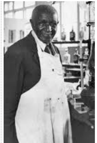
George Washington Carver