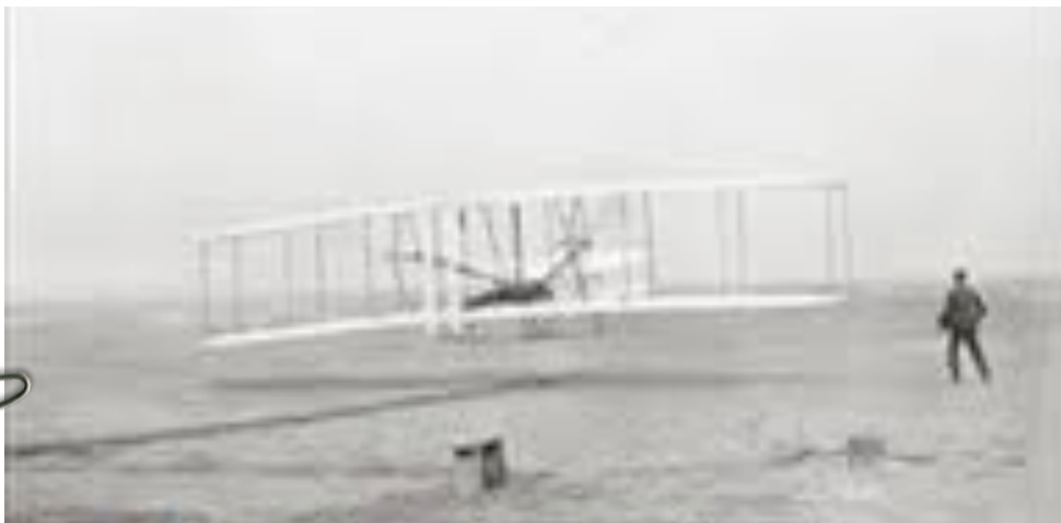
The Wright Brothers!