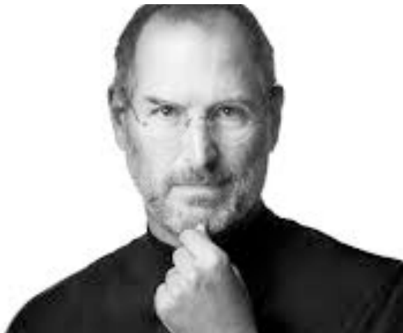
The late Steve Jobs, the mind behind Apple

This activity can be especially fun following a class discussion on table manners and formality. Create the eating space like a formal event and have your young people use their best manners and politeness as they simultaneously attempt to eat a challenging meal with their new invention.