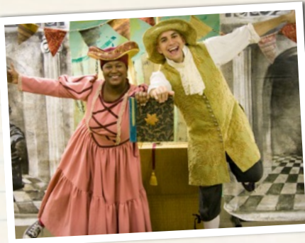
Some fun theatre vocabulary!