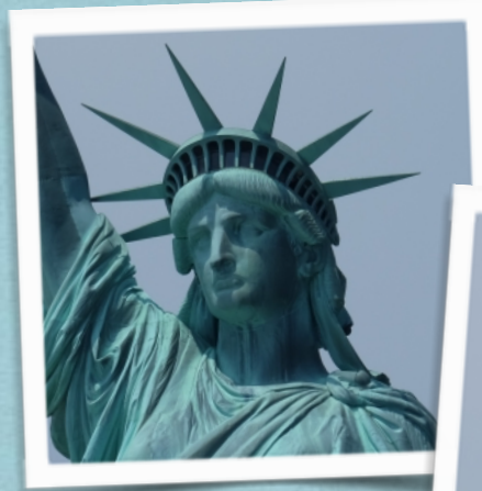
During her restoration in 1986, Lady Liberty's torch was covered with thin sheets of real 24k gold!

There are seven rays on the Statue of Liberty's crown; one for each of the seven continents. They are up to nine feet in length and weigh as much as 150 pounds each!