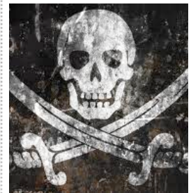
A pirate flag. Yar!!!

1 out of every 10 students who drops out of school does so because of repeated bullying.