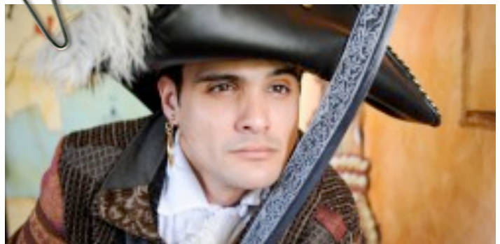
One of our pirates!

This 45-minute production has been especially designed for grades in Pre-K-5th grade. This show is one of dozens that we tour throughout the world from our base in Asheville, NC!