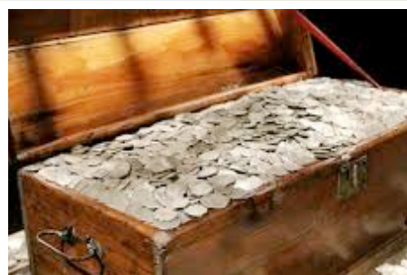
Remember the Pirate Golden Rule!

Teach young people that avoiding conflict may not always be possible. But engaging in bullying is never a good choice. What's the difference between the two and how can students handle either situation?