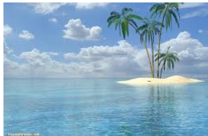
Bully Bay, to transport you outta the cafetorgymnaisum