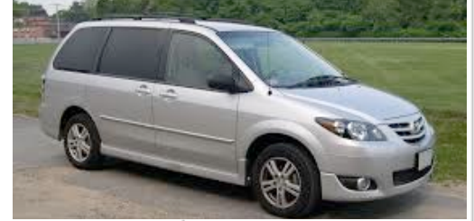
We travel the country in mini vans!