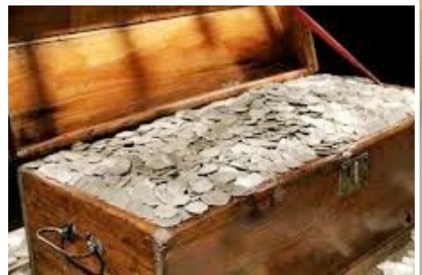
What's your most favorite treasure?

Teach young people that avoiding conflict may not always be possible. But, with a little creative problem solving, we can try to come up with a solution that works for everyone! Talk about how Jim Hawkins used quick thinking to get out of trouble at the end of our show.