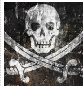
Imagine yourself sailing with Jim Hawkins on the Hispanola

97% of all the Earth's water can be found in our beautiful oceans