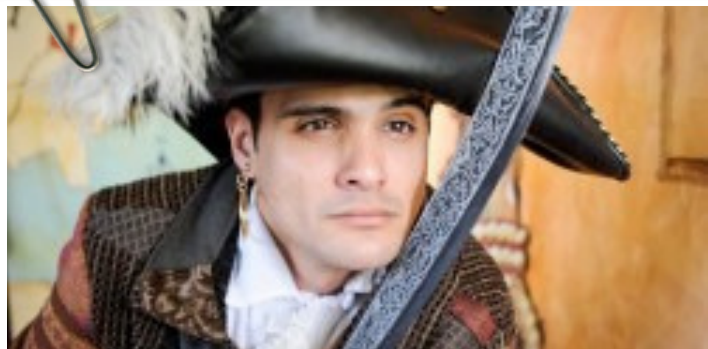
One of our pirates, yargg!

This 45-minute production has been specially designed to be enjoyed by audiences from Pre-K to Adult. This show is one of dozens that we tour throughout the world from our base in Asheville, NC!